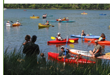
Kayak Regatta 2021! Currently planned for Saturday, August 14 (raindate: Sunday Aug 15)