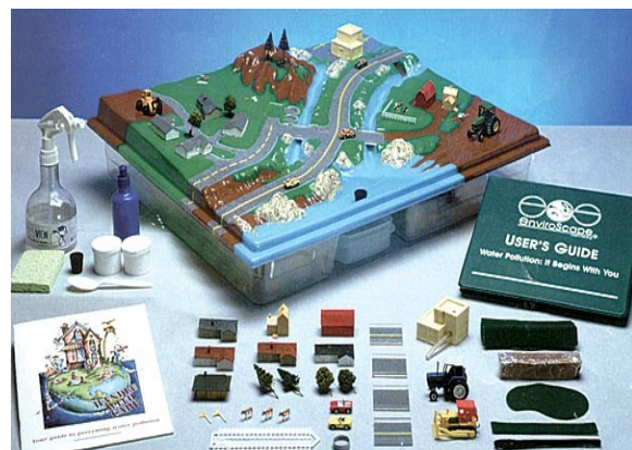
Our Enviroscope Model—if you know of a teacher or class who would like to borrow it or have us go to their school to teach with it, please let us know.