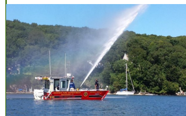
The Goshen Fire Boat Leads the Kayak Regatta!!

Thanks to all our participants and volunteers for another successful event!