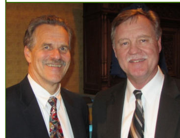
Our two Auctioneers!!

Bring your friends! More tickets are available at the door! A glass of wine, beer & soda and dessert bar is included and a cash bar will be available.