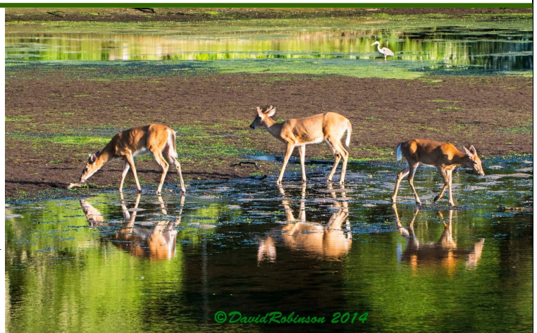
Above pic by David Robinson—Deer in Banning Cove with Great Blue Heron

Our Pumpout Boat can be contacted by calling the cell number for the boat: 860-287-2774 (text or call) . Tips for the hard work the guys put in are always welcome!