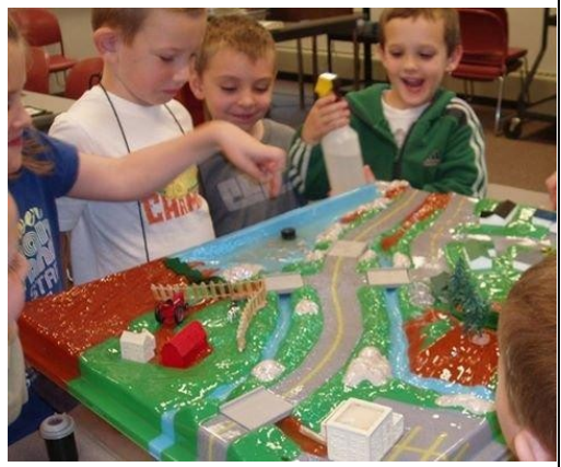
Children playing with Enviroscape.

You'll also see our Coalition Display at Celebrate East Lyme Day on Saturday, July 15 and Old Lyme Midsummer Festival on Saturday, July 29. I'm looking for STR-STH members to hang out in the booth with me to answer questions and encourage people to sign on to our cause. Please contact me at the below number & join me at either event!