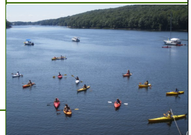
Enjoying the Niantic River in front of the Oswegatchie Hills!