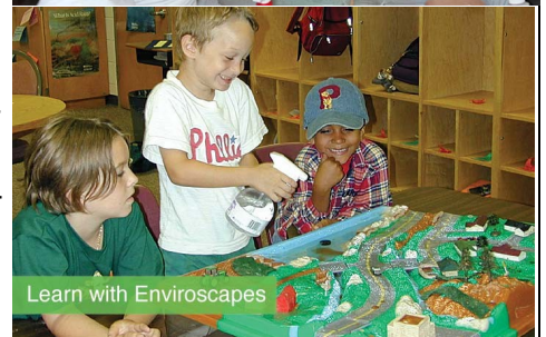
Children learning by using the Enviroscape