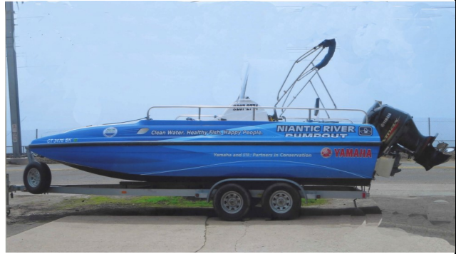
Our new Pumpout boat looking sharp!!

We started our Pumpout Program in the summer of 2003. Prior to our program the dumping of waste from boat holding tanks was still allowed in sections of the Long Island Sound. The Niantic River was the last area that didn't have access to a pumpout boat. Our creating a pumpout program allowed the DEP to designate the whole coast of CT as a No Discharge Zones for marine sewerage.