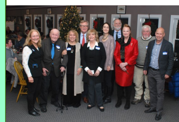
Board members with honored guests at our Annual Holiday Fundraiser at Flanders Fish in December 2018

Will be Saturday, August 17 (raindate: Sunday Aug 18)