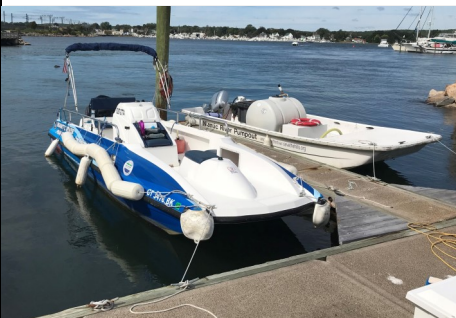
Our two pumpout boats at dock