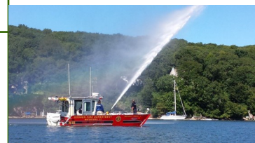
Goshen Fire Boat leads the kayak parade up the Niantic River!