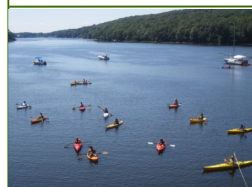
Kayak Regatta in front of the Oswegatchie Hills!