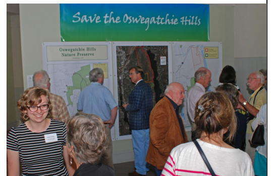
Guests studied three maps of the Oswegatchie Hills Nature Preserve, the adjoining 236 acres we seek to protect, and how they drain into Niantic River Estuary.