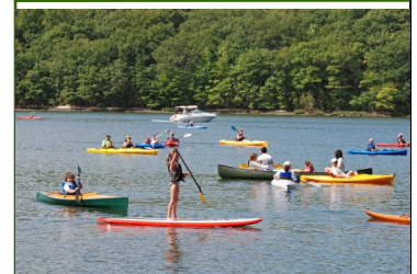
2015 Kayak Regatta participant trying out a SUP with fellow kayakers in front of the Oswegatchie Hills!