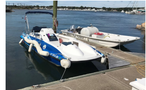
Our new Pumpout Boat next to our backup boat.

We started our 16th season of the Pumpout Program Memorial Day Weekend. Spread the word—the Niantic River and the entire Long Island Sound is a No-Discharge Zone by order of the U.S. EPA. Our Pumpout Boat can be contacted by calling the cell number for the boat: 287-2774 (cell phone). Although fully funded by grants, tips for our workers are appreciated!!