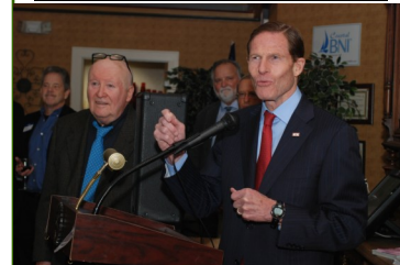
Fred with U.S. Senator Blumenthal speaking about the importance of Saving the Hills